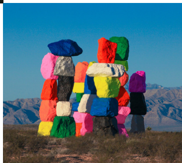
Seven Magic Mountains